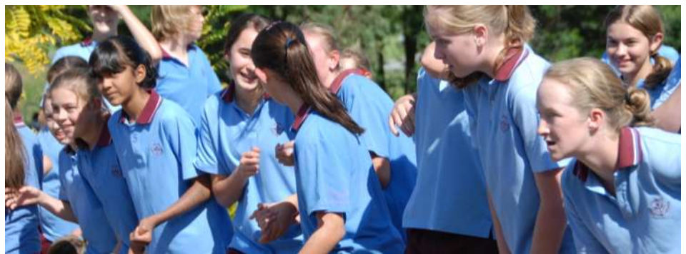
Secondary Cross Country