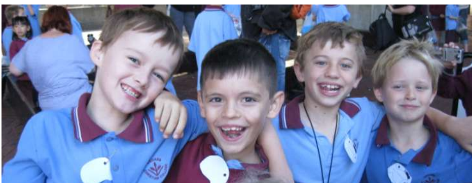
Year 2 visits Aquarium