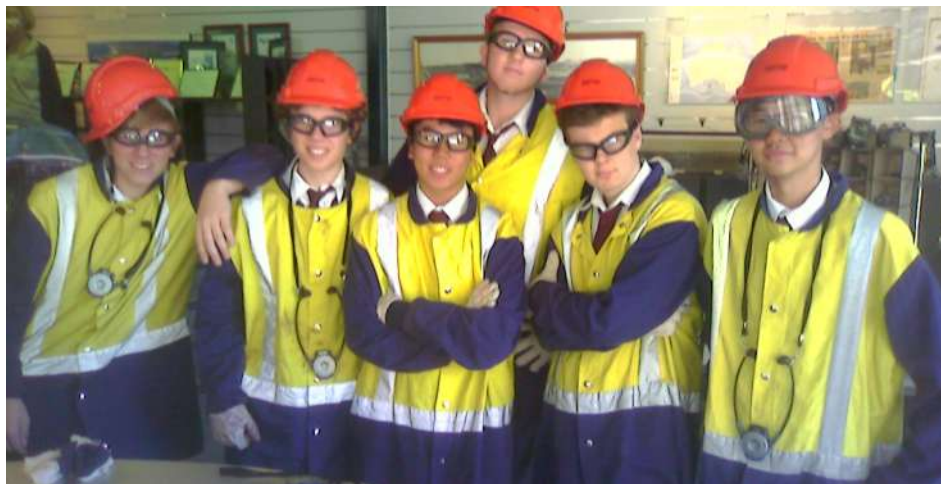
Senior students visit Bluescope Steel