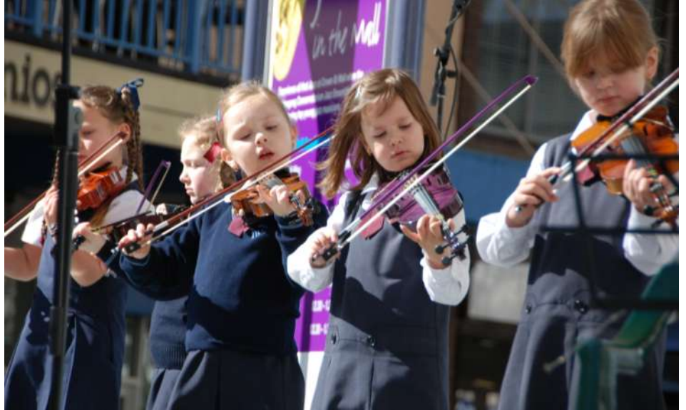
Junior School Choir performs at Wollongong Mall 2010

Your child will be receiving a family competition activity soon. See if your family can meet the challenge!