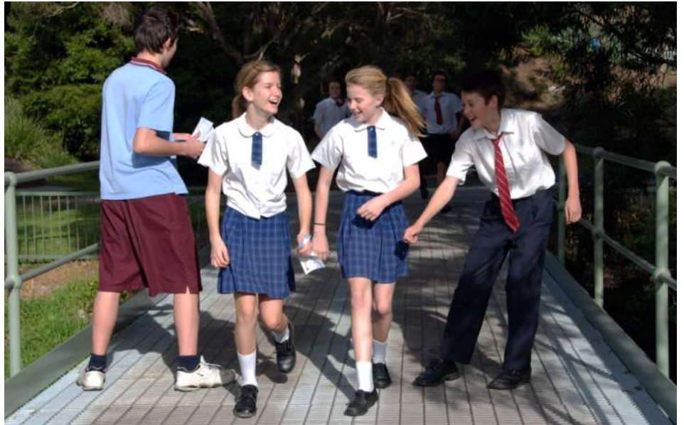
Year 8 Students take part in their own Amazing Race

Year 8 started with the more traditional television show "It's Academic", where students competed in teams to show what they knew about various aspects of early Australian life. Next we played "Don't Forget the Lyrics", also organised and hosted by the students. By this stage it became obvious that students were studying for longer and including questions more difficult than the teacher would have dreamed of! The unit of work finished with the ultimate television spectacle, and students constructed a detailed school wide course of "The Amazing Race"! Affectionately called "The Amazing Koori Race", teams raced around the school one afternoon, ripping open envelopes that revealed challenges to perform and History questions to solve. Competition was tough as students raced from as far as the canteen to