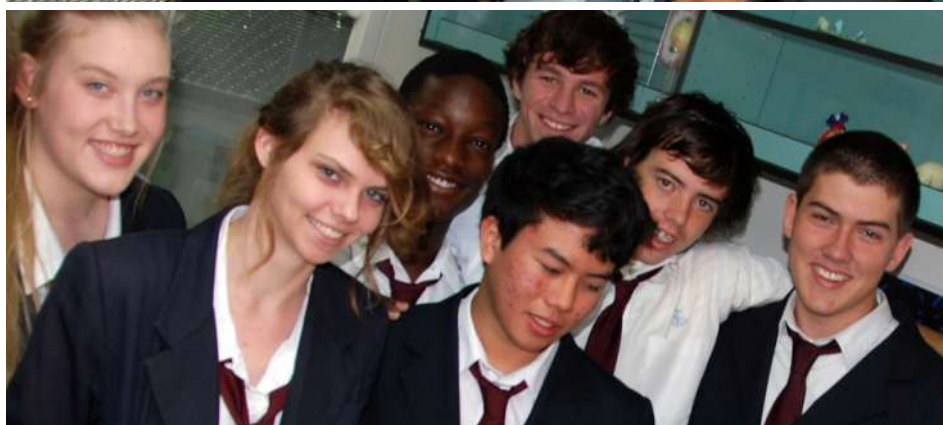
Yr 11 Students learn about Nanotechnology

technologies were presented including the lifesaver bottle, which converts unclean drinking water into pure drinking water. Also demonstrated was a nanotechnology which made it so your clothes couldn't get wet and could even hold water in your pocket! The workshop got everyone involved at all the stations and was clearly a fun time for everyone."