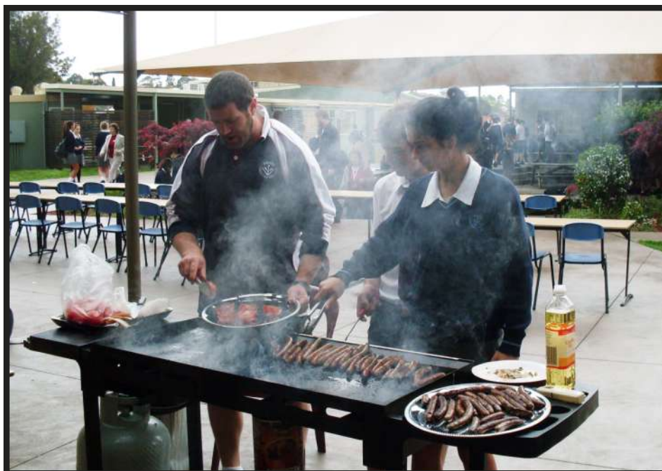
Cooking for the SLC Big Breakfast