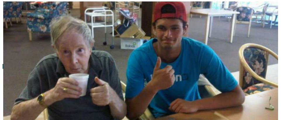
Year 10 serve at the Nursing Home

part of the schools program for the past five years. "Students are keen to get out, test their skills in a new and challenging environment. We want to instil values of service, hard work and giving back in our students."